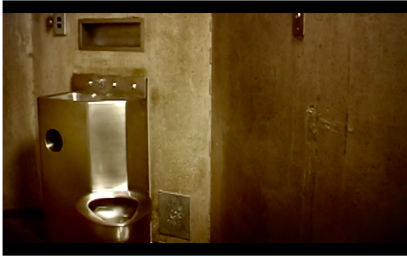
Figure 2 Sink and Toilet