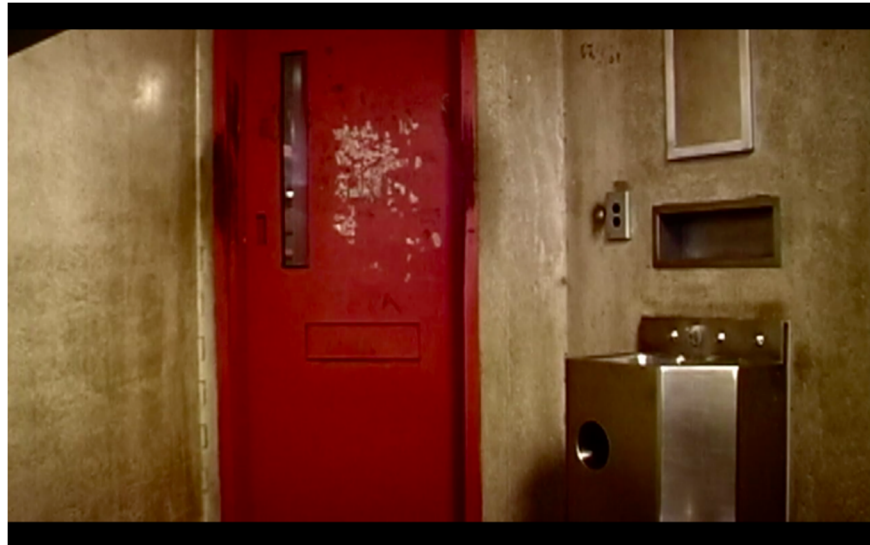
Figure 5 Sink and Door

36. A prisoner’s access to fresh air and direct sunlight comes from a trip to what is called the “recreation cage,” a space slightly larger than a cell, surrounded by approximately fourteen-foot concrete walls and topped by a steel cage. The only view is of the sky. Figures 6