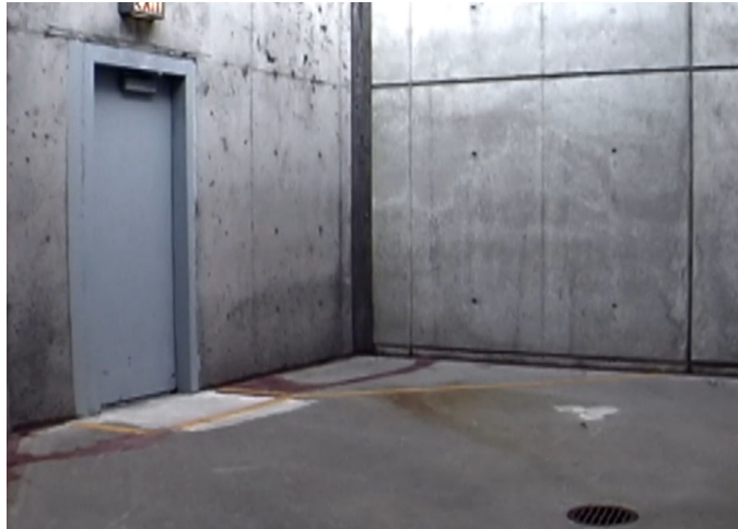
Figure 6 “Recreation Cage”

and 7, also taken from the documentary The Worst of the Worst: Portrait of a Supermax (2012), show the “recreation cage.”