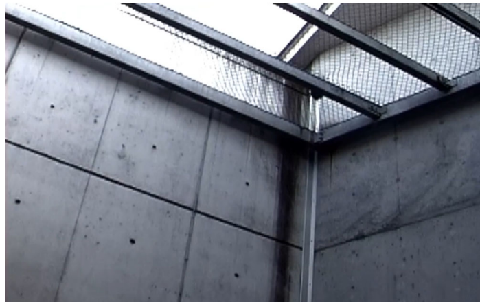
Figure 7 “Recreation Cage”

37. Mental illness is prevalent at Northern. Many prisoners there have histories of mental illness, have been diagnosed with mental illness, and/or have been treated with