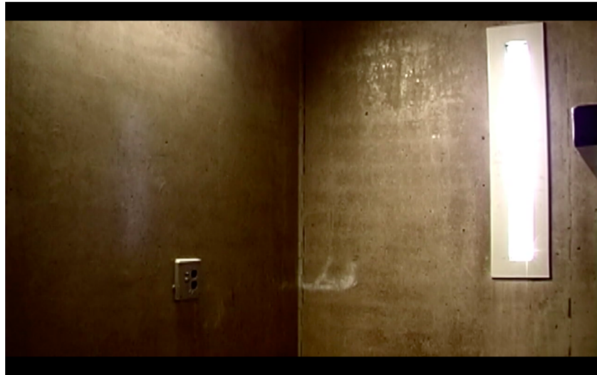
Figure 4 “Window” Slot