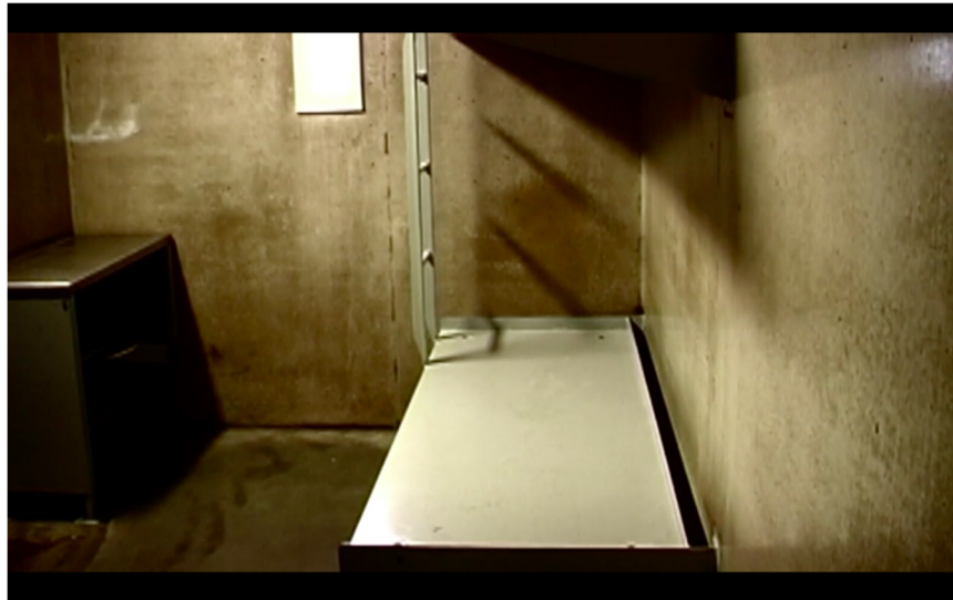
Figure 3 Bed and Desk