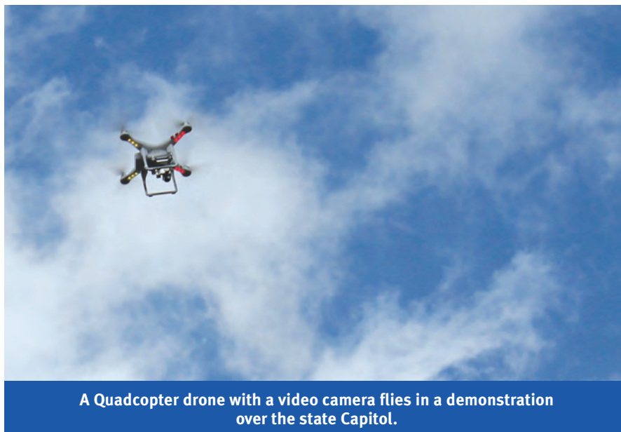
A Quadcopter drone with a video camera flies in a demonstration over the state Capitol.