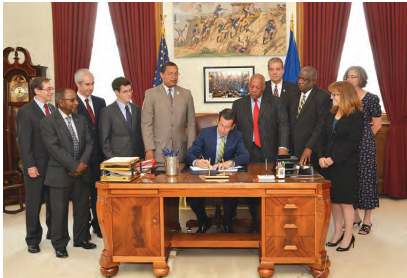
Representatives of the ACLU of Connecticut and NAACP of Connecticut join legislators to witness Gov. Dannel Malloy's ceremonial signing of Taser reform legislation at the state Capitol.