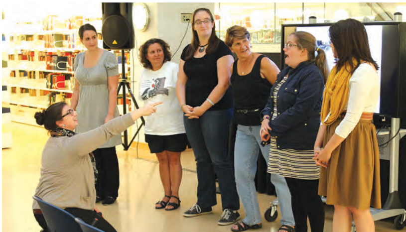
Members of the audience join the Sea Tea Improv troupe for some dramatic comedy at a Banned Books Week observance at Hartford Public Library.